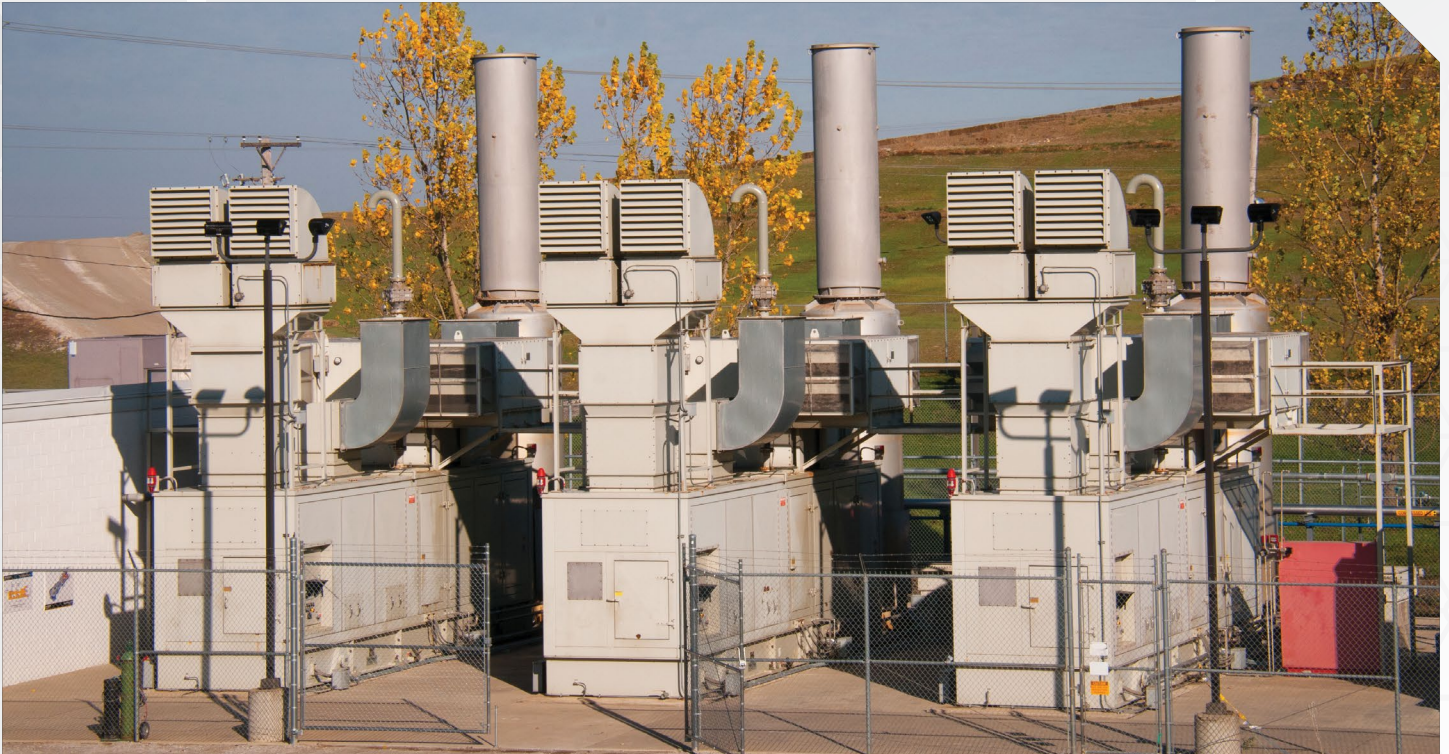
Livingston Landfill Methane Gas Plant